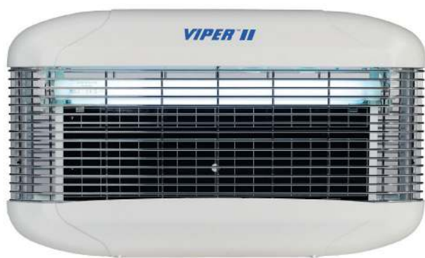
Glue board version

Genus® Viper is quick and easy to service and can be wall mounted, suspended from the ceiling or free standing.